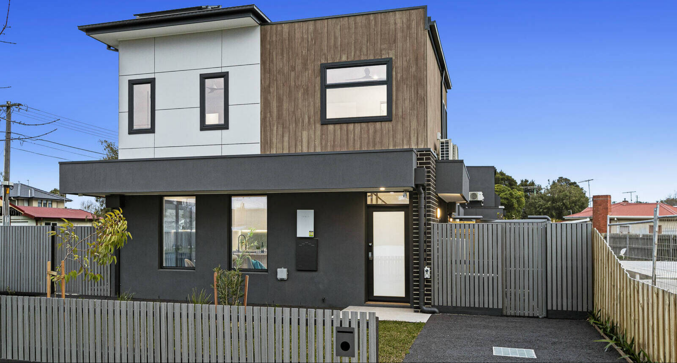
47 Derrimut Street Albion